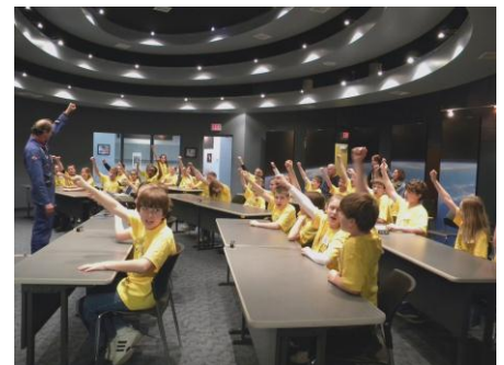
A winning team at the Challenger Space Center!